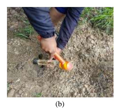
Figure 3. Soil bulk density tests: (a) steel core barrel; (b) sampling process.

The detailed procedures and summarized test results are outlined below. The summary of Table 4 which presents the results of soil index properties testing across multiple landslide-prone locations, reveals characteristics. diverse soil In Kutambaru, both on the natural surface and slip surface, high water content is noted, while Jl. Lintas Berastagi-Lau Kawar displays relatively lower water content. Sarinembah stands out with significant Atterberg limits, indicating substantial plasticity, and Kutabuluh exhibits a balanced composition of moisture and plasticity.