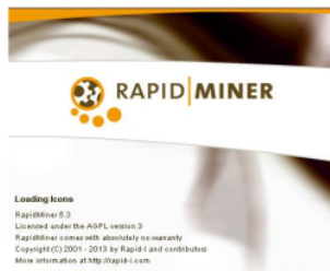
Figure 3. Initial view of rapid miner

The calculation process is carried out using an auxiliary application, namely rapid miner. This application is widely used for the process of measuring the accuracy of a data mining method. Figure 3 and Figure 4 are the main display on the rapid miner.