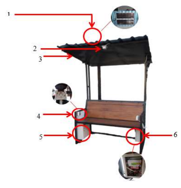
Fig 2. Features and components of outdoor charging bench

The hardware components shown in figure Number 1 shows the 100 wp solar panel. Number 2 is the lighting lamp. Number 3 is the spandex roof. Number 4 is a power outlet. Number 5 is the battery box Number 6 is the electrical panel box.